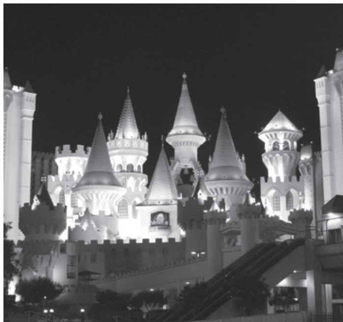
Excalibur, Las Vegas, NV